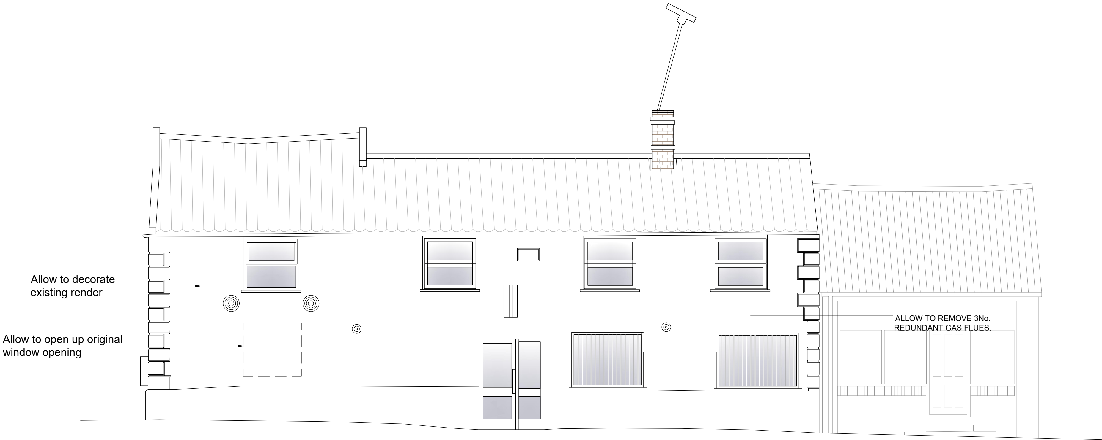
Proposed East Elevation SCALE: 1:50 A1